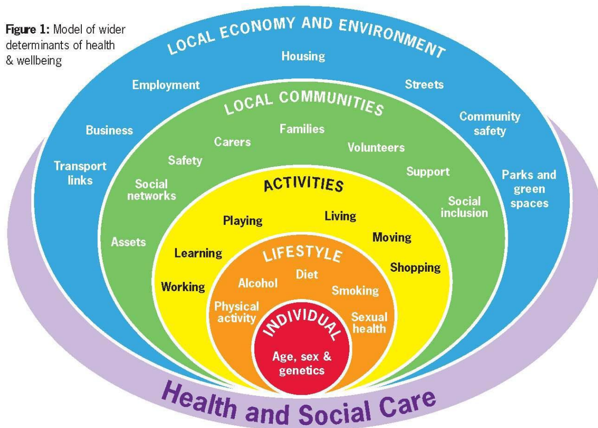
Figure 1: Model of wider determinants of health & wellbeing

When people are experiencing problems with available to support people when they are their health or with caring for themselves, we needed. We will aim to ensure that these are will work together to ensure that appropriate integrated, and focussed on the needs of the local health and social care services are individual person.